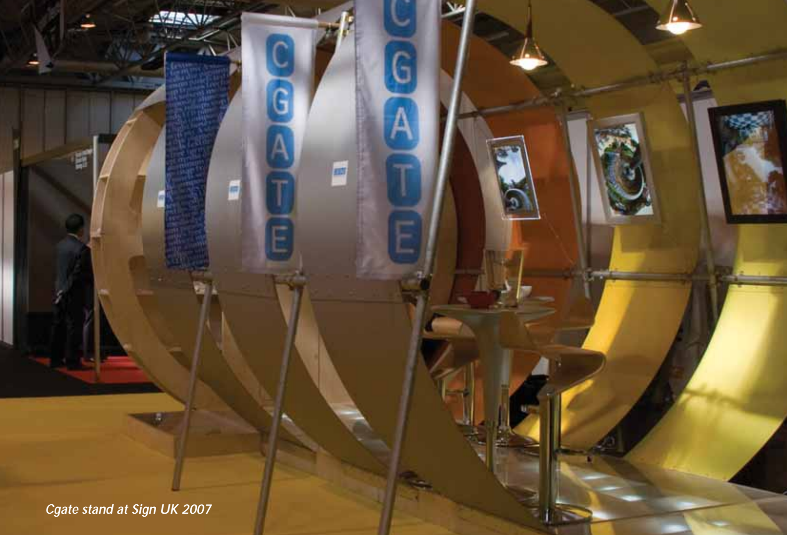
Cgate stand at Sign UK 2007